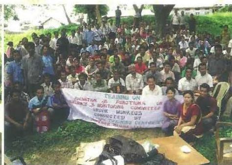
Off campus training conducted at Rongara Block (South Garo Hills, Meghalaya)