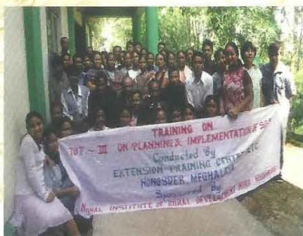
Trainees posing for photo session at ETC