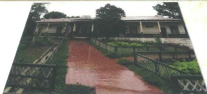
ETC (ADMINISTRATIVE BUILDING)

The ETC became fully functional in 2005 with the appointment of the seniormost faculty member of SIRD as the Principal followed by the appointment of faculty and staff. The ETC being the lone extension training centre in the State covers all the 39 community development blocks located within the 7 districts of the State of Meghalaya. As per the directives of the Government the ETC conducted training on Flagship Programmes with emphasis on NREGS, Local Governance, Watershed and Gender issues. Besides these, the ETC progressively conducted demand driven programmes in tune with the requirements of the government departments and the changing environment triggered by reforms and globalization. The ETC, receives annual grants under recurring and non-recurring heads from the Central and State Government on yearly basis