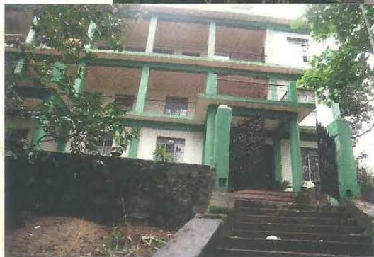
Front View of ETC Hostel